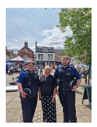
What a lovely day out for residents!

On 31<sup>st</sup> May and 1<sup>st</sup> June, North Warwickshire SNT officers attended The Atherstone Big Weekender - a great family day out with market stalls, eateries, live music and activities.