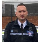
PC 2190 Howells