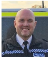
PC 1372 Breeze

North Warwickshire South Safer Neighbourhood Team Covering: Coleshill Town, Fillongley, Corley, Packington, Maxstoke, Shustoke, Arley, Old Arley, Ansley Common, Ansley village, Birchley Heath, Furnace End and Over Whitacre