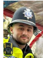
PC 2300 Thompson