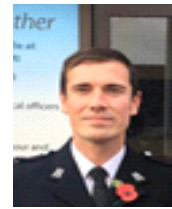
PS 671 Skelsey